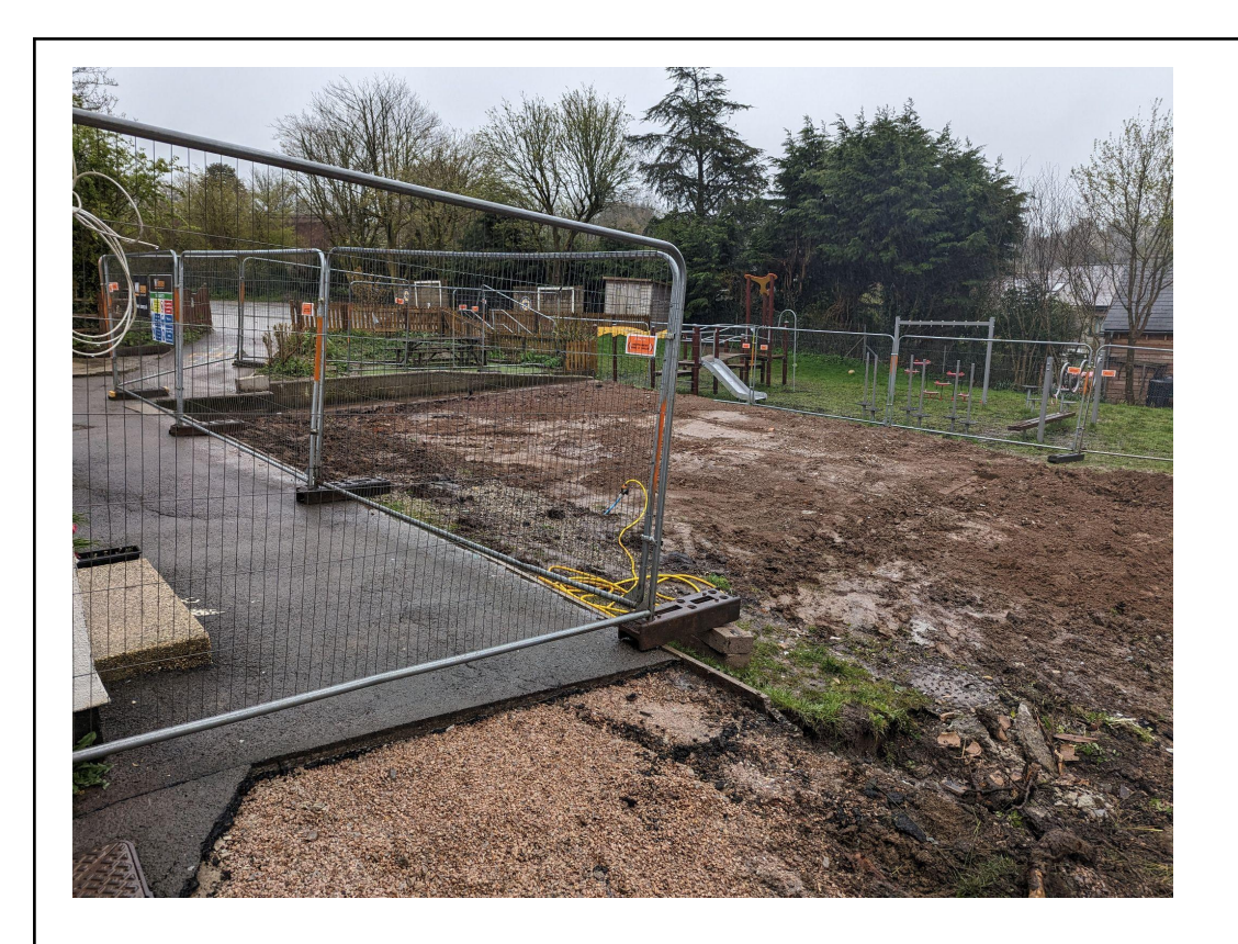
Photo 05 - Devon Lady Unit Nr1 demolished and material arisings carted from site.