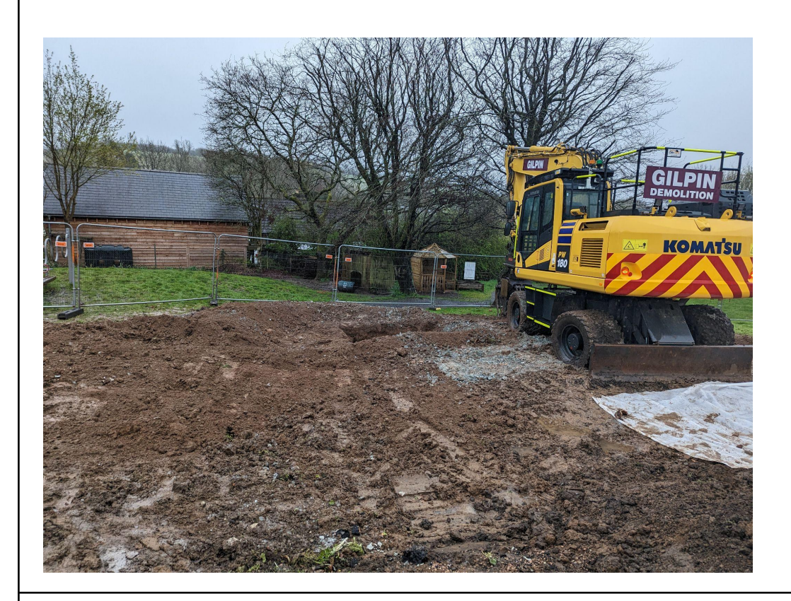
Photo 06 - Devon Lady Unit Nr2 demolished and material arisings carted from site.